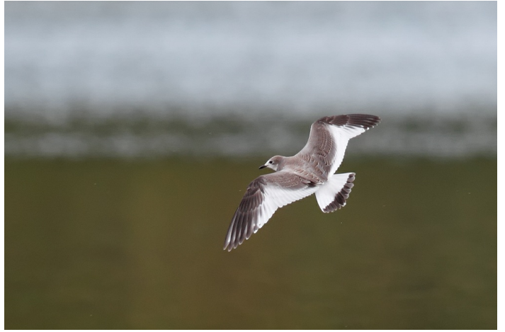
Gull Sabines KahleLakePA 20170906 1D4 8 E9H9285M.jpg Gull Sabines KahleLakePA 20170906 1D4 8 E9H9427M.jpg