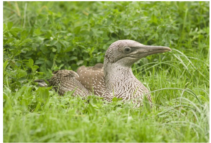
Image 3. Northern Gannet, East Lampeter Twp., Lancaster 23 October 2020. This juvenile rested in a field until captured by a wildlife rehabilitator.

One in East Lampeter Twp., Lancaster 23 October 2020 (Pamela Fisher (p), Zachary Millen (p); 065-01-2020; Class I-Pe). 7/0. A juvenile found in a Con Agra Foods parking lot, following a foggy night and presumed to have crash landed due to disorientation. Workers moved the bird out of the parking lot to a nearby field to keep it safe from truck traffic. A wildlife rehabber was contacted to capture the bird.