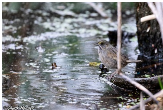
Image 5. Seaside Sparrow, FDR Park, Philadelphia 9 May 2020.

One at FDR Park, Philadelphia 9 May 2020 (Charles Homler (p), many observers; 831-01-2020; Class I-P). 7/0. A surprising find and the observer was fortunate to obtain good photographs. The bird was seen by several other observers the following day. Extremely rare away from the coast.