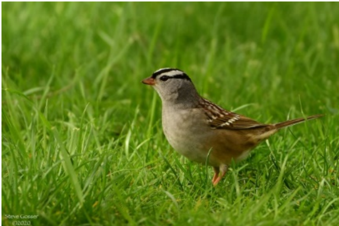
Image 6. White-crowned (Gambel's) Sparrow, McCandless Twp., Allegheny 6 May 2020.