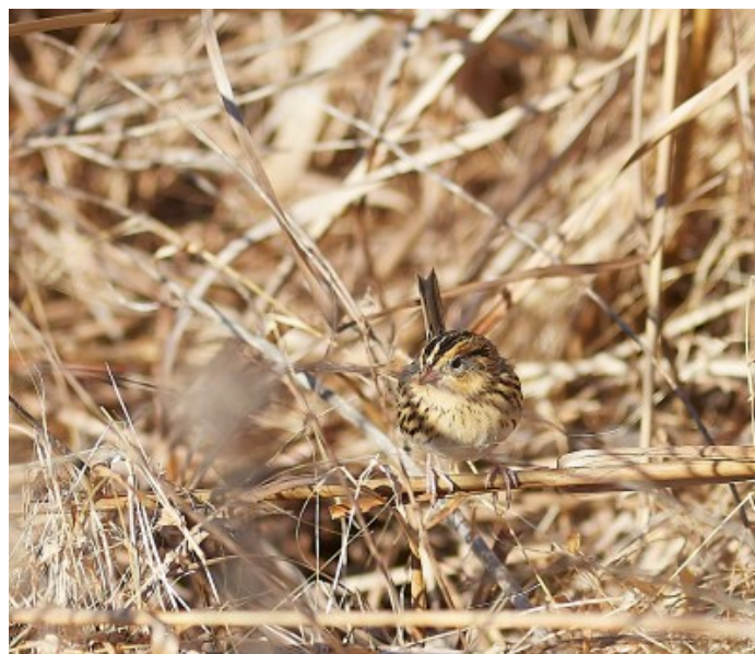
Image 4. LeConte's Sparrow, Hamburg, Berks 9 March 2020.