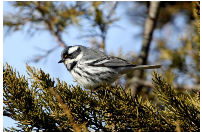
Image 7. Black-throated Gray Warbler, Easton, Northampton 9 January 2020.

One in McConnellsburg, Fulton 4 November 2020 (Tracy Moseby (p); 737-06-2020; Class I-Pe). 7/0. This male was only seen for 30 minutes at a private residence.