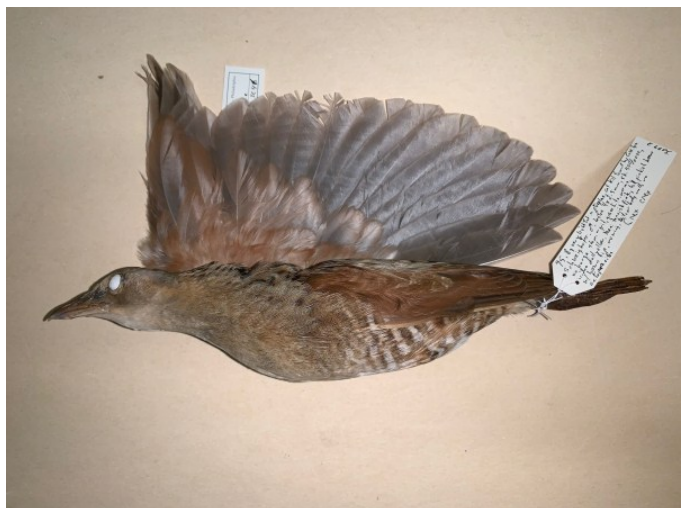
Image 4. Corn Crake specimen.