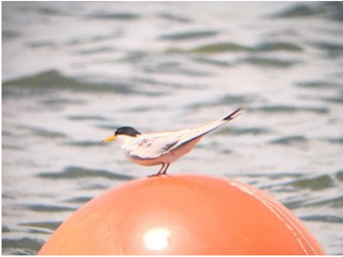
Image 6. Least Tern , one of two at Marsh Creek SP, Chester 15 June 2019. The photo shows the yellow bill, black legs and feet and white forehead patch.