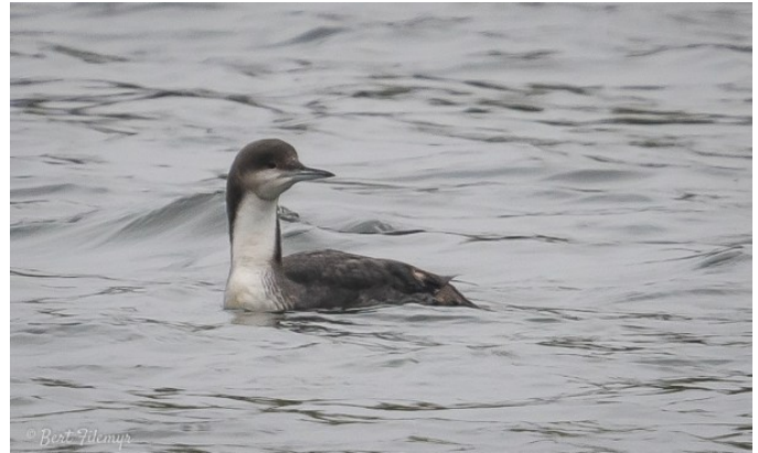
Image 7. Pacific Loon , Beltzville SP, Carbon 26 April 2019.

One at Octoraro Res., Lancaster 27 July 2019 (Pamela Fisher (p); 087-01-2019; Class I-P). 7/0.