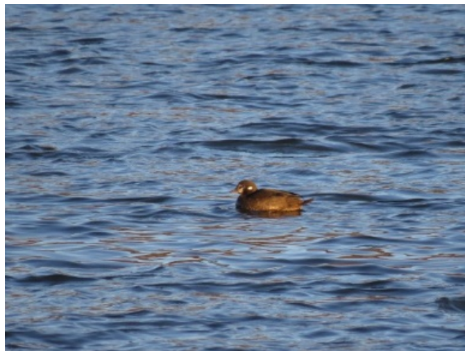
Image 1. Harlequin Duck , Blawnox, Allegheny 16 November 2019.

A female at Nockamixon SP, Bucks 22 January 2019 (August Mirabella (p) 155-01-2019; Class I-P). 7/0.