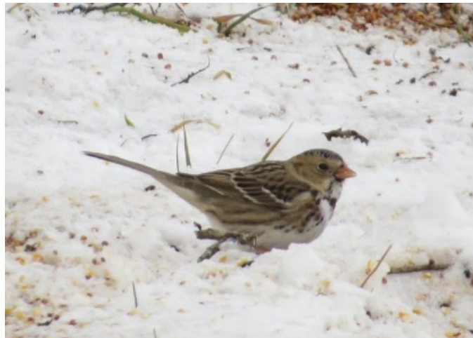
Image 11. Harris's Sparrow , Lykens, Dauphin 13 February 2019.

One at Lykens, Dauphin 13 February 2019 (Ian Gardner (p); 839-01-2019; Class I-P). 7/0. A bird in basic plumage was feeding with a flock of various sparrows