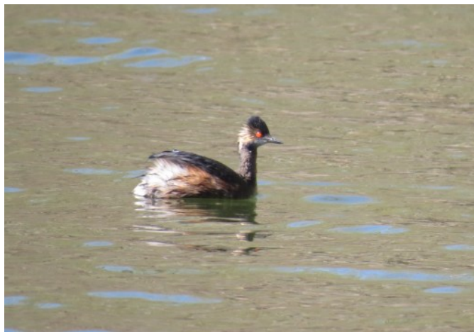
Image 2. Eared Grebe, Presque Isle SP, Erie 11 May 2019.