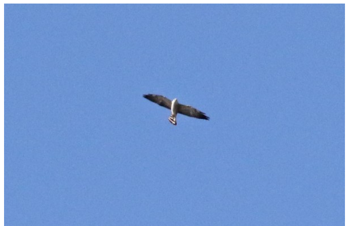
Image 9. Mississippi Kite , Chickies Rock County Park, Lancaster 20 May 2019. The banded tail indicates this bird is a sub-adult and the short outer primaries can be clearly seen in the photo.

One at Chickies Rock County Park, Lancaster 20 May 2019 (Meredith Lombard (p); 171-03-2019; Class I-Pe). 7/0.