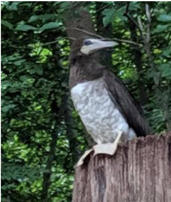
Image 8. Brown Booby, Easton, Northampton 20 August 2019. The bird was discovered resting on a stump along the Delaware River. The mottled breast and gray bill indicates this individual is immature.