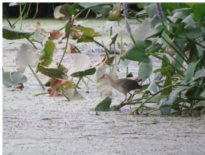
Image 5. Purple Gallinule, John Heinz NWR, Philadelphia 16 September 2019.