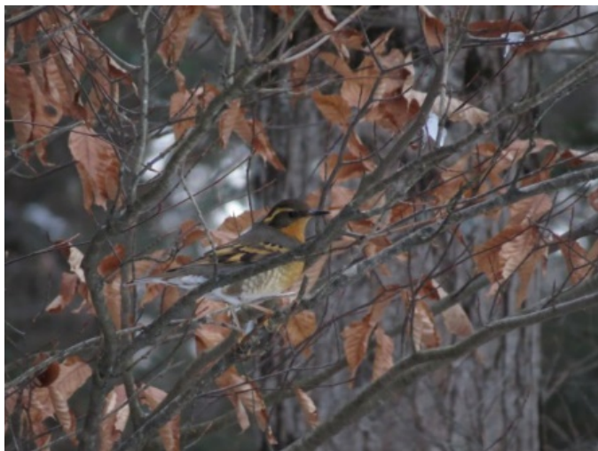
Image 10. Varied Thrush, Tioga 8 December 2019.