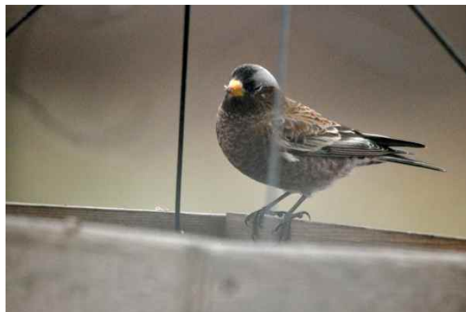
Image 12. Gray-crowned Rosy-Finch, Kempton, Berks 19 December 2009. The discovery of this individual establishes this as the first documented state record for Pennsylvania.