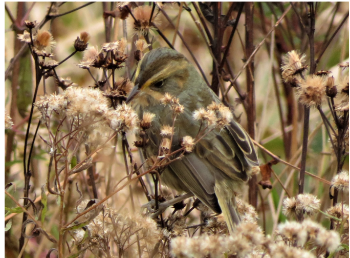
Image 12. Nelson's Sparrow (subspecies subvirgatus), Pine Run Dam, Bucks 1 November 2017.