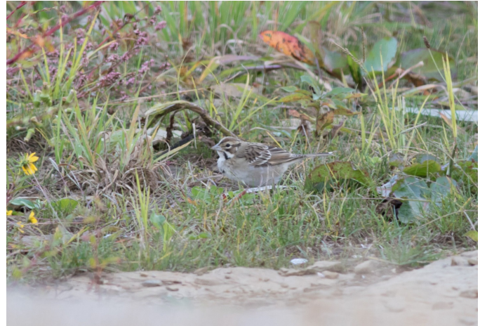
Image 11. Lark Sparrow, Donegal Lake, Westmoreland 8 September 2017.

One at Donegal Lake, Westmoreland 8 September 2017 (Mike Fialkovich (p); 820-01-2017; Class I-P). 6/0. The bird was discovered 7 September by Josh Lefever but not relocated after the second day.