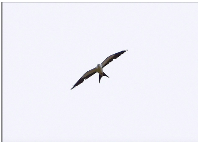
Image 6. Swallow-tailed Kite, Exton Park, Chester 8 June 2017.

One at Exton Park, Chester , 8 June 2017 (John Mercer (p), et al.; 168-03-2017; Class I-P). 6/0.