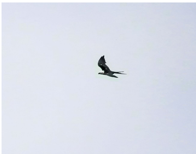
Image 5. Swallow-tailed Kite, Lake Nockamixon, Bucks 5 June 2017.

One at Lake Nockamixon, Bucks 5 & 8 June 2017 (Fred Zahradnik (p), John Good; 168-02-2017; Class I-P). 6/0.