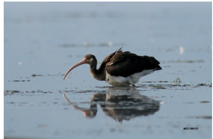
Image 4. White Ibis, Conejohela Flats, Lancaster 17 August 2017.

White Ibis wandered north in a similar pattern to Roseate Spoonbill (see below) in the summer of 2017 with records from New Jersey, New York, Maryland, Delaware, inland Virginia, Ohio, Indiana and inland in Georgia.