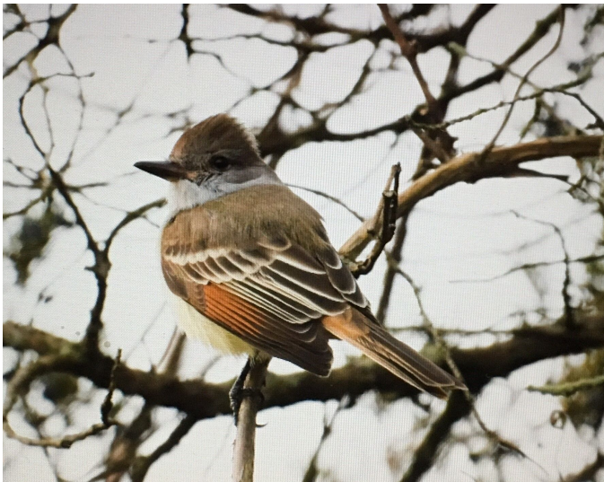
Image 10. Ash-throated Flycatcher, Green Lane Park, Montgomery 17 December 2017.