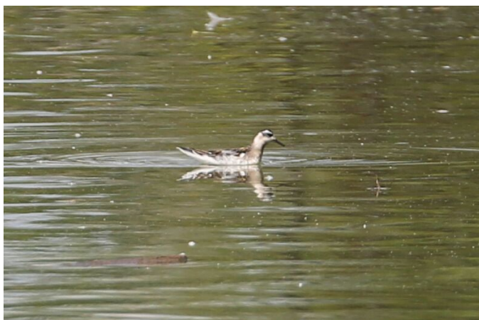
Image 1. Red Phalarope, Green Lane Park, Montgomery 29 April 2017.