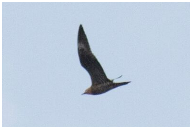
Image 2. Long-tailed Jaeger, Williamsport River Walk, Lycoming 26 August 2017. The long central retrices can be seen in the photo.