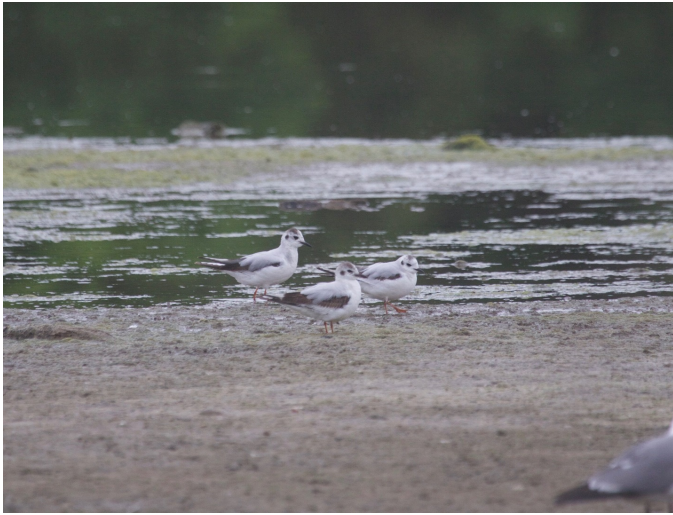
Image 3. Three first winter Little Gulls at Van Sciver Lakes in Tullytown, Bucks 22 May 2017.