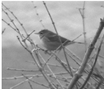
Plate 8. MacGillivray's Warbler ( Oporornis tolmiei ). This immature male videoed here 19 December 2004 was present on the grounds of the Rodale Institute, Berks , 18-20 December 2004 for a 1 st state record.

One immature male on the grounds of the Rodale Institute, Berks , 18-20 December 2004. (AJ; DF (v), BMo, PR (p), TW, et al.; Class I; 763-01-2004). 6/0. Photograph published in NAB 59:371. Initially found on the Allentown CBC, the bird was relocated and observed by several birders over the next two days. It disappeared following the incursion of cold, wet weather. This is a first state record (Morris 2005).