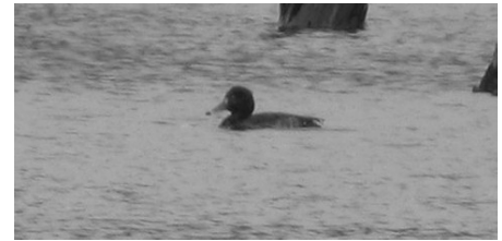
Plate 3 . Tufted Duck ( Aythya fuligula ). This female was present at SGL 56, Bucks , 22-28 March 2004. Photographed here 26 March.

One female at SGL 56, Bucks , 22-28 March 2004. (AM(v); DF (v),TFH (p), m.ob; Class I; 141-01-2004). 6/0. This bird was loosely associating with a large flock of Ring-necked Ducks and the videos submitted showed the small tuft and solid dark head, back and breast. This was a first county record as well as a third state record. Photograph published in PB 18:114 and NAB 58:365.