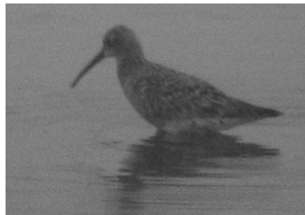
Plate 5. Curlew Sandpiper ( Calidris ferruginea ). This bird at Martin's Creek PPL, Northampton , 13 May 2004, represented the 2 nd documented record for Pennsylvania.

Curlew Sandpiper ( Calidris ferruginea ) (2) One adult at Tullytown, Bucks , 25 July 2002. (DW; DDe, DF(v), SF, JH, AM(v), NP, RWi, m.ob; Class I; 316-01-2002). 7/0. Photograph published in PB 16:185. One adult male at Martin's Creek PPL, Northampton , 13 May 2004. (RWi(p); BE(p), et al.; Class I; 316-01-2004). 6/0. Photograph published in NAB 58:367 and PB 18:74. (Wiltraut 2004). These two reports constitute the first and second documented state records respectively.