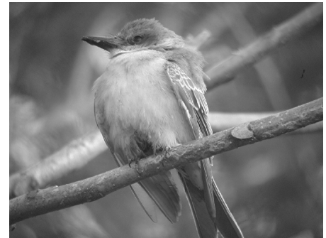
Plate 7. Gray Kingbird ( Tyrannus dominicensis ). This immature was seen by many during a five day stay in Pomeroy, Chester , 13-18 December 2004 (Geoff Malosh).

One immature in Pomeroy, Chester , 13-18 December 2004. (JMe; DF (v), AG, NH, LL, AM (v), GM (p), NP (p), m.obs.; Class I; 559-01-2004). 6/0. Photograph published in PB 19 #1 cover and NAB 59:262. This long-overdue southern rarity was found on a Christmas Tree Farm where Meloney was searching for a holiday tree. The identification was confirmed the following day and well over a hundred birders saw the bird during its five-day stay. This is a first state record (Pulcinella 2005).