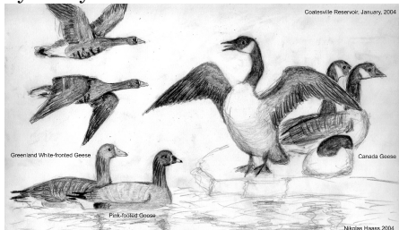
Plate 2 . Drawing of Pink-footed Goose ( Anser brachyrhynchus ) and other geese at Coatesville Res, Chester . (Nikolas Haas).

One at Chamber's Lake, Chester , 9-17 January 2004. (JC(p), NH; m.obs.; Class I; 108-01-2004). 7/0. Photograph published in PB 18:31 and NAB 58:223. This obliging individual moved between Chamber's Lake and nearby Coatesville Res. during its stay allowing long-studies by many.