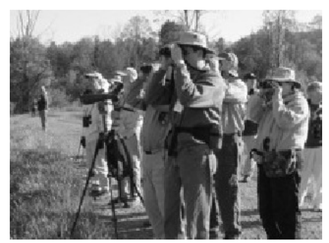
PSO outing at a recent annual meeting