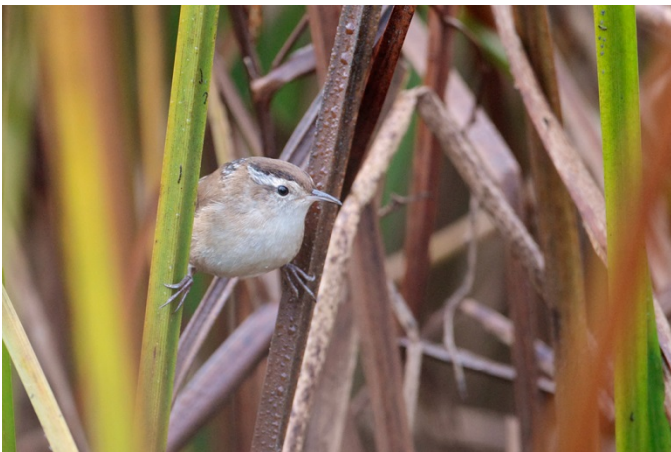
Marsh Wren ( Cistothorus palustris ). Normally rare in Allegheny, Marsh Wrens have become frequent fall visitors to the splendid wetlands at Wingfield Pines. Up to 2 were present beginning 19 September 2014 and at least one stayed deep into the winter season. The bird shown here was one of two at the wetlands 29 September.