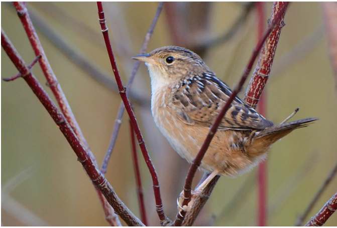
Sedge Wren ( Cistothorus platensis ). Another star at Black Swamp, Lawrence this season was this Sedge Wren, one of up to 3 at the swamp 10 to 17 October 2014 (here 12 October). Normally shy, the birds at Black Swamp this fall were (for the most part) anything but, as demonstrated by this excellent portrait.