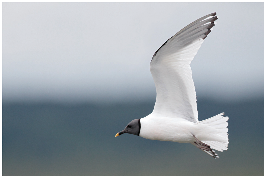
Image 3. Sabine's Gull, underwing detail. Pymatuning Spillway, Crawford.