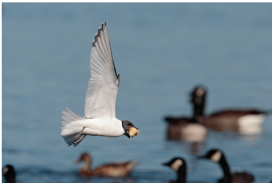
Image 4. Sabine's Gull with bread during its last known approach to the spillway.

The bird at the Pymatuning Spillway 5 to 7 September 2014 was extraordinary in a number of ways. First, as mentioned, it was an adult, just the fourth for the state. But more than that, it was this bird's remarkably confiding nature that burned it into the memories of dozens of happy birders who made the journey to see it. The Pymatuning spillway at Linesville is a well-known tourist attraction, the place everyone knows as "where you go to feed the fish", or alternatively, "where the ducks walk on the fish". Indeed there are hundreds of carp at the spillway, which entertain the hundreds of people who come every day in the warm months to feed bread to them—and to the mallards, geese, and gulls that are also ubiquitous at the site. I will never forget the directions to the place that Scott Kinzey once gave to me. Of course I have been quite familiar with the spillway since I started birding in the early 1980s, but the roadway along that part of the lake is quite long, and the lake is on both sides. Birds that are said to be "at the spillway" often might actually be anywhere along that stretch of the lake, on either side of the road, and there is quite a large area to scan. Anyway, in late August 2009,