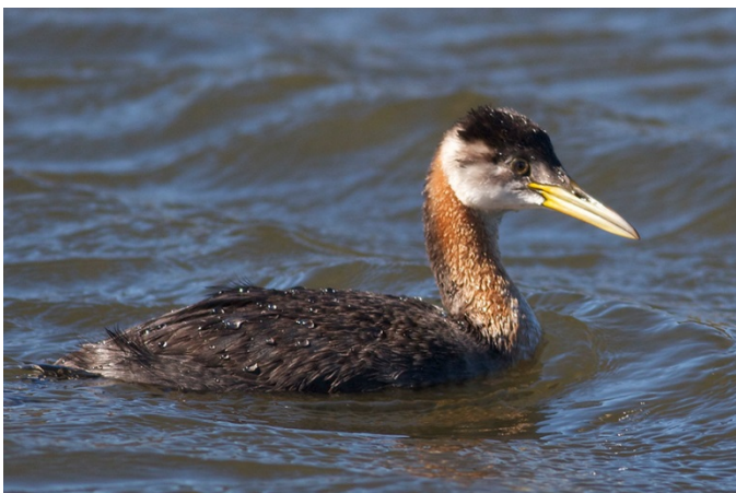
Red-necked Grebe ( Podiceps grisegena). Red-necked Grebes appeared in 10 counties and Erie (where annual), a strong showing by fall season standards. This bird was at Middle Creek W.M.A., Lancaster 14 October (here 19 October) to 5 November 2014.