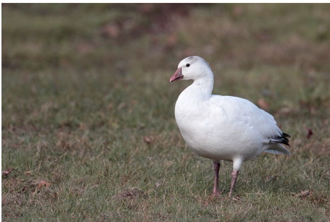
Chen Sp. This bird at North Park, Allegheny 22 to (here) 23 November 2014 was very likely a juvenile Ross's Goose, but the apparently intermediate structure of the bird's bill raised the (albeit slim) possibility of a hybrid Ross's x Snow, and gave some observers pause before adding it to their lists. (Geoff Malosh)