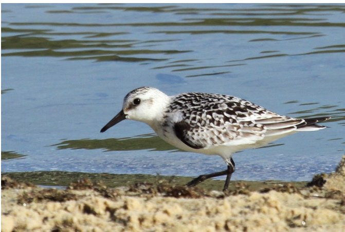
Sanderling ( Calidris alba ). Sanderlings seem to be found in "inland" counties (away from Erie ) increasingly often in fall. This juvenile at Bald Eagle State Park 16 September 2014 was one of as many as four at that location this autumn. (Wayne Laubscher)