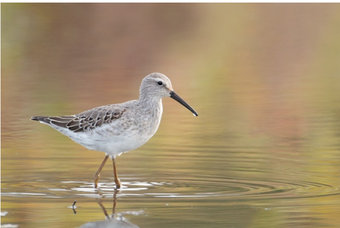
Stilt Sandpiper, Black Swamp, Lawrence County. See p. 254.