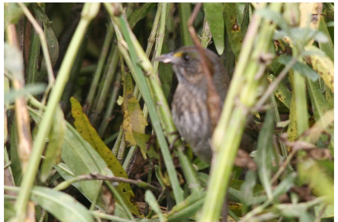
Seaside Sparrow ( Ammodramus maritimus ). Pennsylvania's sixth (if accepted) Seaside Sparrow was present on the Bainbridge Islands, Lancaster , in the middle of the Susquehanna, 4 to 6 October 2014 (here 5 October). It was seen by several birders who made the trek to the site via canoe, but proved difficult (yet not impossible) to pin down for photos.