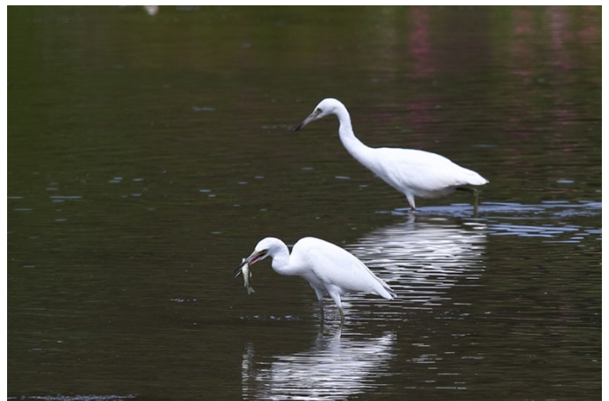
Little Blue Heron ( Egretta caerulea ). Little Blue Heron fared better than their Snowy cousins, with records in seven counties. These two juveniles were at Wildwood Lake, Dauphin 8 August (here) to 11 September 2014, a nice long stay that allowed dozens of birders the chance to see them. (Dave Kerr)