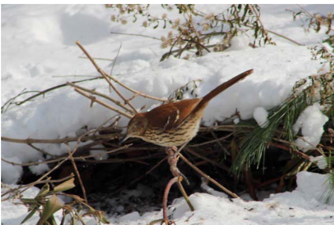
Brown Thrasher ( Toxostoma rufum ). Few "half hardy" species were reported following the onset of an abnormally deep freeze in mid-November. One exception was this Brown Thrasher still making a go of it in the snow at Tionesta, Forest through at least 29 November 2014, shown here 20 November. (Flo McGuire)