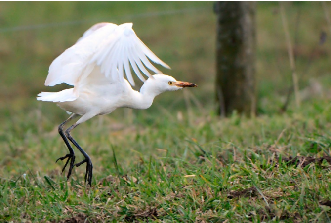
Cattle Egret, near Mercer, Mercer County. See p. 257.