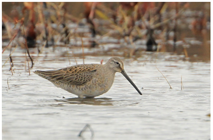
Long-billed Dowitcher ( Limnodromus scolopaceus ). This juvenile at Black Swamp, Lawrence 5 to 13 November 2014 (here 12 November) was the last of three star attractions at Black Swamp this season, which drew the attention of birders from around the region. The other two headliners were two very cooperative Stilt Sandpipers and up to three equally cooperative (for most observers, anyway) Sedge Wrens that were present in October. (Jeff McDonald)