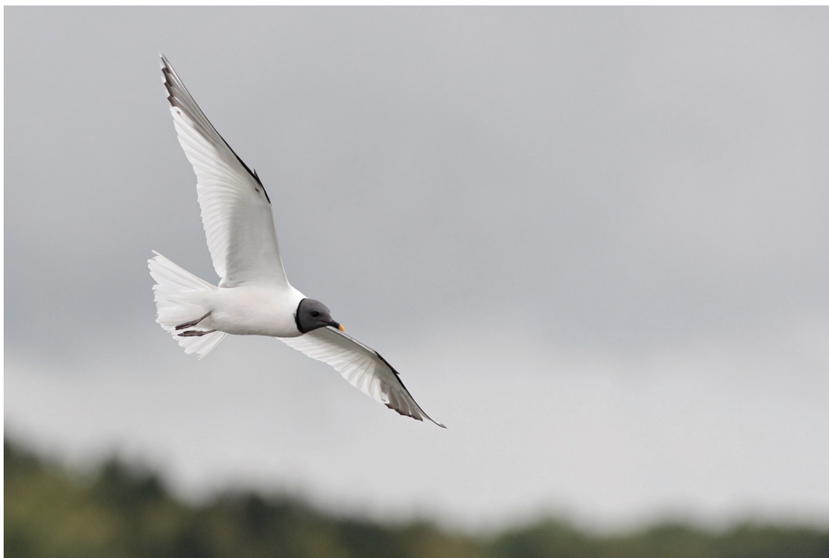
Image 1. Sabine's Gull at the Pymatuning Spillway, Crawford 6 September 2014.

Of all nearby states and provinces, Ontario by far has the most records of Sabine's Gulls, and the species is a well-established annual fixture of early fall migration at Van Wagners Beach in Hamilton, on the far western shore of Lake Ontario. Sabine's Gulls have also long been known from the western Great Lakes states of Michigan,