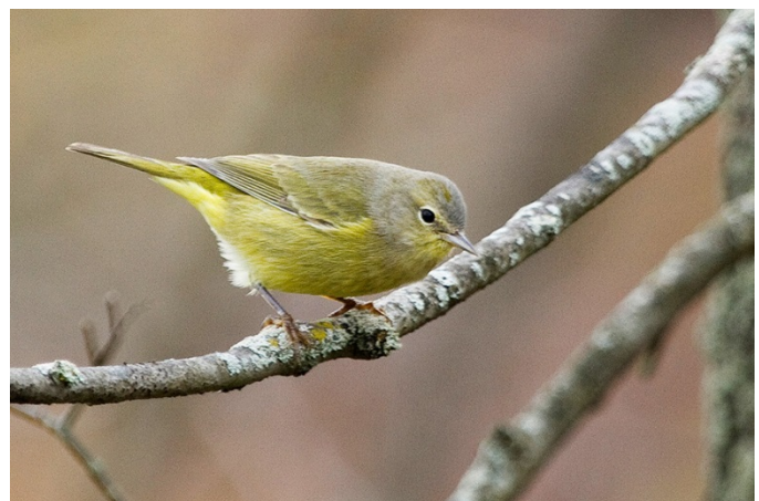
Orange-crowned Warbler ( Oreothlypis celata ). Orange-crowns are perhaps a bit over-reported in Pennsylvania in fall, due to the possibility of confusion with other confusing fall warblers. That was not the case with this cooperative bird, however, at Old Crow Wetland, Huntingdon 20 October 2014.