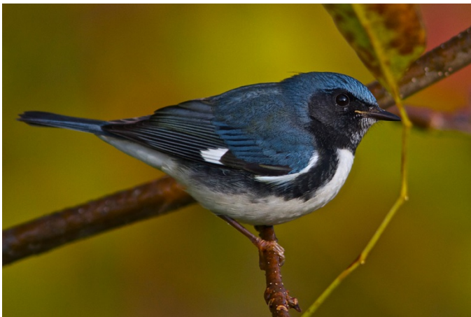
Black-throated Blue Warbler ( Setophaga caerulescens ). Portraits of this striking species don't get much better than this remarkable image made at Downingtown, Chester 9 October 2014. ( Holly Merker )