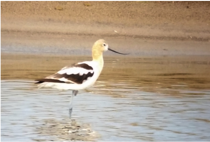
American Avocet ( Recurvirostra americana). Gull Point in Erie has always been the premiere shorebirding spot in Pennsylvania, and in recent years has enjoyed a renaissance following some positive habitat management at the site. This avocet at the point 20 August 2014 was one of nine for the season.