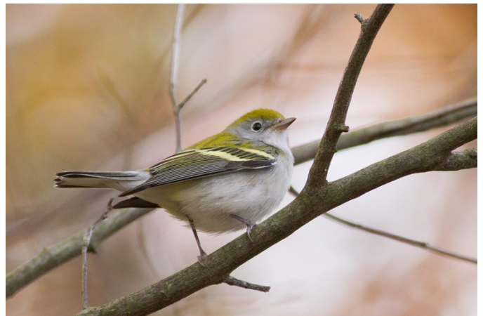
Chestnut-sided Warbler, Hummelstown, Dauphin County. See p. 246.