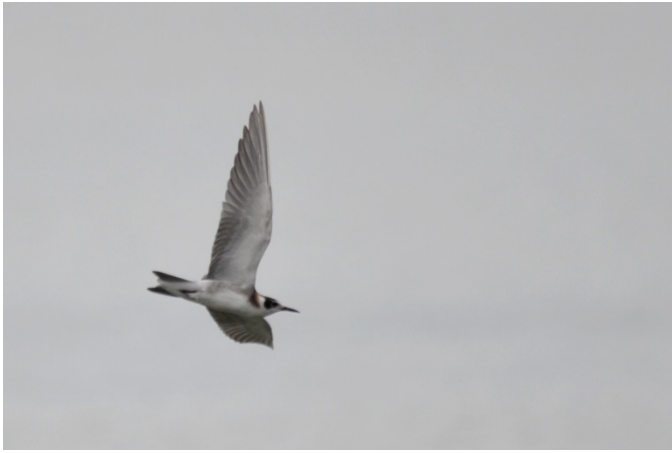
Black Tern ( Chlidonias niger ). There were an impressive 20 records of Black Tern in 12 counties this season, and at least six of those records were associated with the passage of a weather system 31 August 2014. This juvenile was one of an impressive 24 at Lake Arthur, Butler during the 31 August event. ( Aiden Place )