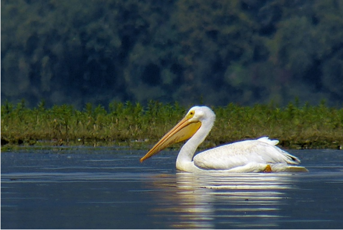
American White Pelican, Conejohela Flats, Lancaster County. See p. 252.