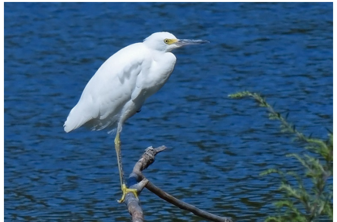
Snowy Egret ( Egretta thula). It was not a good showing of Snowy Egrets, which were recorded in just two counties this fall. This bird at Muddy Run, Lancaster 25 August 2014 was one of two in Lancaster this season.