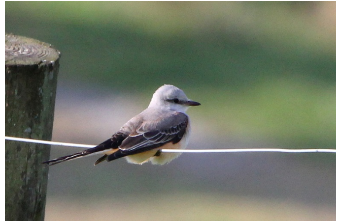
Scissor-tailed Flycatcher ( Tyrannus forficatus). For the second autumn in a row a Scissor-tail made an appearance in Pennsylvania. This bird was at N. Fort Zellers Road, Lebanon 25 (here) to 26 October 2014.