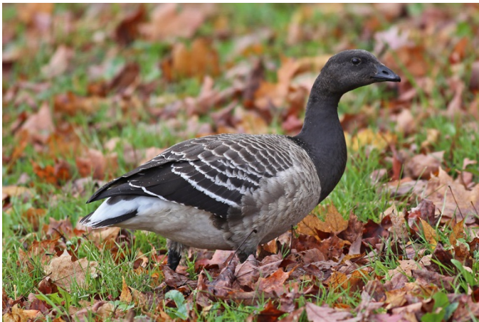
Brant ( Branta bernicla ). Brant are much more common in eastern Pennsylvania than in the west during fall migration, though even in the east it's still a treat to see one well. This cooperative juvenile was at Lake Towhee Park, Bucks 19 October to 3 November 2014 (here 23 October) and was seen by many. (Bill Keim)