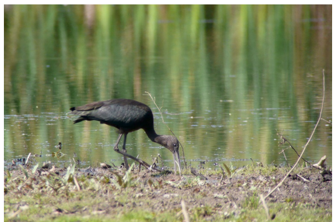
Glossy Ibis ( Plegadis falcinellus). A great find for western Pennsylvania was this Glossy Ibis at Yellow Creek State Park, Indiana 11 to 25 September 2014 (here 15 September), which also obliged hopeful birders with a long stay.