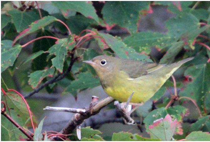
Connecticut Warbler ( Oporornis agilis ). It was one of the better seasons in recent memory for Connecticut Warbler, with reports from 18 counties. This image was very nicely captured at Little Gap, Carbon 21 September 2014. ( Dustin Welch )