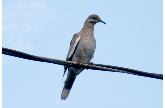
White-winged Dove, Plumstead Twp., Bucks County. See p. 238.