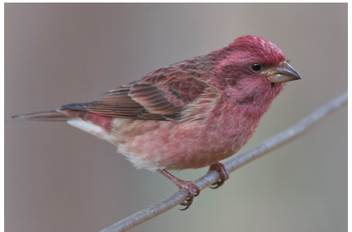
Purple Finch ( Haemorhous purpureus ). Purple Finches moved in impressive numbers this fall, with reports in 37 counties by season's end. This male was beautifully photographed at Peace Valley Park, Bucks 28 October 2014.