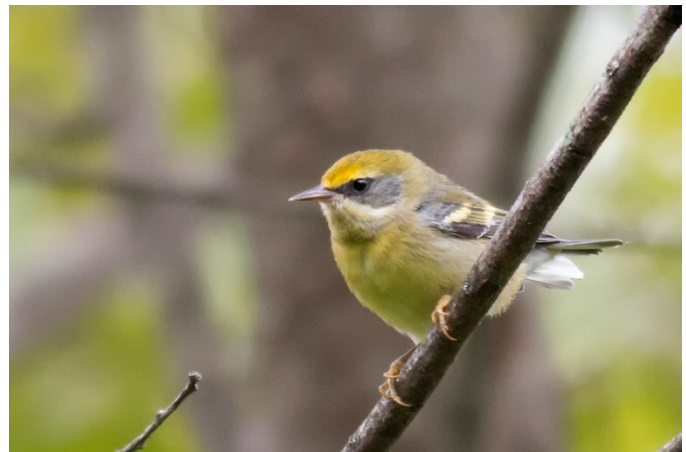
Lawrence's Warbler. This beautiful Lawrence's Warbler was a great find (and photo) at SGL 180, Pike 4 August 2014. Though Brewster's Warblers are found nearly annually in the fall, Lawrence's is far more unusual, making this image that much more special.