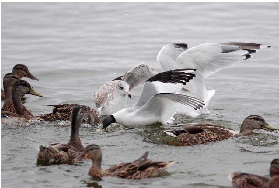
Image 2. Sabine's Gull scrumming for bread at the Pymatuning Spillway.

This bird was probably the most cooperative Sabine's Gull in Pennsylvania history. It spent much time on the riverbank or flying nearby, and was even observed accepting handouts of small minnows and shrimp from fishermen and birders,