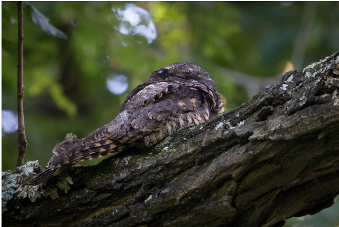
Eastern Whip-poor-will ( Antrostomus vociferous ). Whips are rarely seen on their day roosts, making this bird at Washington Park, Washington 28 August 2014 a special treat for a few lucky birders. ( Cris Hamilton )