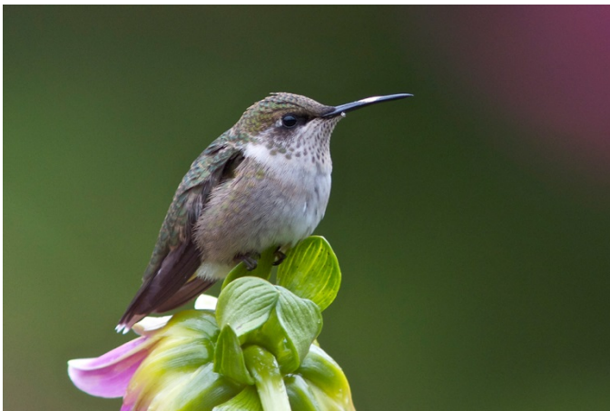
Ruby-throated Hummingbird ( Archilochus colubris ). Several Ruby-throats extended their stays well into October this season, perhaps owing to the rather mild weather for much of September and October. This bird was one of 3 at Longwood Gardens, Chester 10 October 2014. ( Holly Merker )