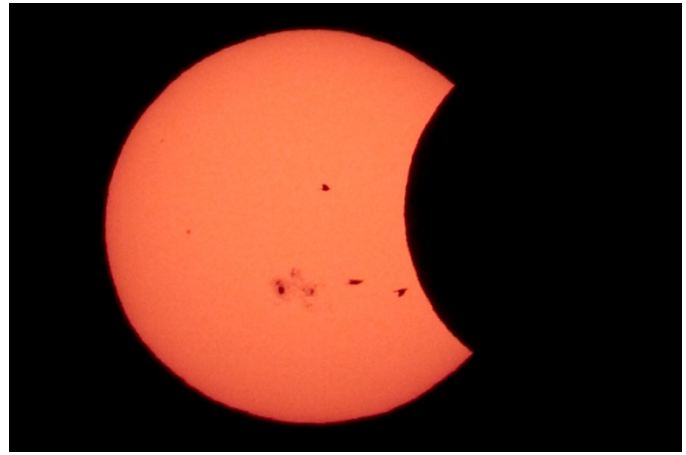
Sunspot AR2192, the moon, and American Robins. With the sun low in the sky during a partial solar eclipse that was visible from Pennsylvania late in the afternoon 23 October 2014, three American Robins passed in front of the solar disk during a photo session of the eclipse. Giant sunspot AR2192 is large the indistinct marking just below center, and the robins are the three silhouettes above and to the right of the sunspot.