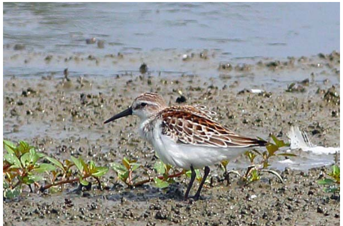
Western Sandpiper ( Calidris mauri ). There are sporadic reports of Western Sandpiper most fall seasons, but few are well documented by photo. That was not the case for this juvenile at Wildwood Lake, Dauphin 4 to (here) 6 September 2014, which was photographed quite nicely.