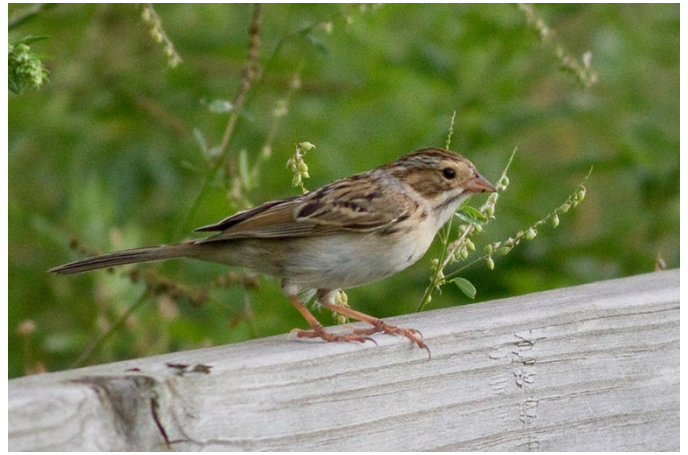
Clay-colored Sparrow ( Spizella pallida). This clay-colored at the Delaware River Trail, Philadelphia 24 August 2014 was quite early for a migrant of this species in the far southeastern corner of the state.