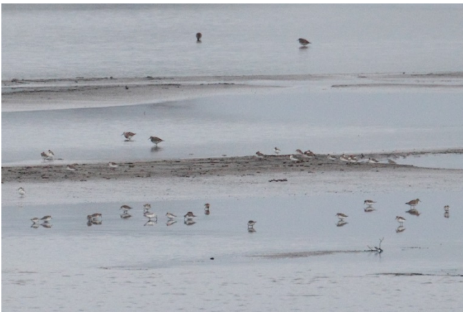
Semipalmated Sandpiper ( Calidris pusilla ). Little Blue Lake in Beaver was briefly famous in the mid-2000s as a shorebird hotspot before it became inaccessible to the public. This season a productive section of the lake was again visible from public areas, and it was quickly found that the lake was still quite attractive to shorebirds. These birds were part of a flock of at least 91 (and perhaps as many as 120) Semis at the lake 31 August 2014, more than doubling the next highest count of this species at any other location in Pennsylvania this season.