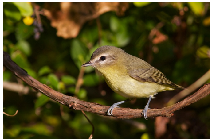
Philadelphia Vireo ( Vireo philadelphicus). Much more common in fall than spring, Philadelphia Vireo is one of the gems of the fall passerine migration in Pennsylvania. This outstanding portrait was made at Downingtown, Chester 3 October 2014.