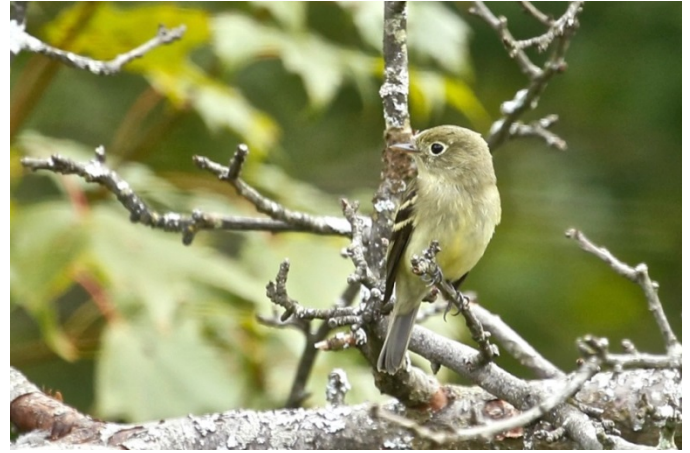
Yellow-bellied Flycatcher ( Empidonax flaviventris ). Yellow-bellied Flycatcher is oft reported in fall but seldom photographed. This bird at Peck Hill, Bradford 1 September 2014 was a nice exception to the rule. ( George Vivino-Hintze )