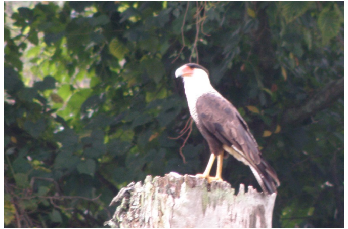
Crested Caracara, near Claysville, Washington County. See p. 265.