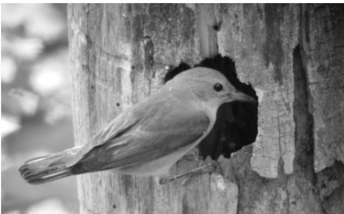
Prothonotary Warbler ( Protonotaria citrea ). Several pairs nested north of their usual range this summer including this bird near Churchville Nature Center, Bucks. Photographed here 29 June 2004.