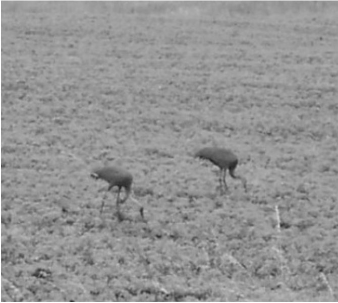
Sandhill Crane ( Grus canadensis). This species continues to expand its breeding range within Pennsylvania. This photo of two adults and two fledged young taken June 2004 confirm nesting near Cambridge Springs, Crawford.