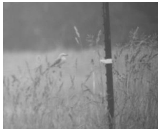
Scissor-tailed Flycatcher ( Tyrannus forficatus ). Photo of this species' typical pose, sitting on a fence scanning an open meadow. Bellgrove, Lebanon 9 June 2004. (Chuck Berthoud)

photos and written documentation that were submitted to the P.O.R.C. clearly rule out Fork-tailed Flycatcher, the other long-tailed flycatcher that has occurred several times in the northeast but still remains hypothetical in our state.— Ed.