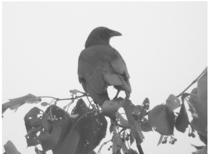
Fish Crow ( Corvus ossifragus ) Another species with an expanding breeding range, this bird established a first Allegheny breeding record when it nested at Forest Hills. This individual was photographed there 10 July 2004.