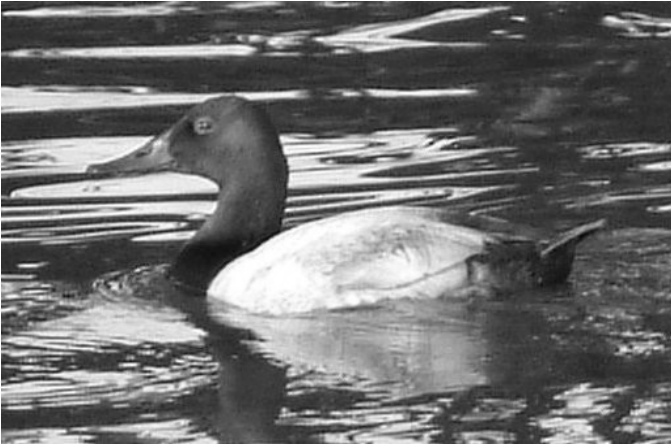
Canvasback ( Aythya valisineria ). Photographed 29 June 2004, this male was present along the Susquehanna River, Dauphin for three days.