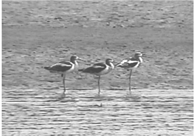
American Avocet ( Recurvirostra americana ). Rare but annual in fall, these three birds were photographed on the Conejohela Flats, Lancaster, 1 August 2004