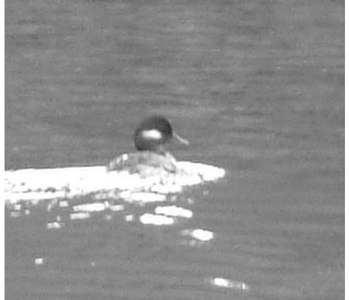
Bufflehead ( Bucephala albeola ). Unusual in mid-summer this bird was found along the Susquehanna River, Dauphin . Photographed 1 July 2004 ( Pat Sabold ).