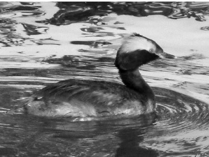
Horned Grebe ( Podiceps auritus). This male was observed along the along the Susquehanna River, Dauphin beginning 23 June 2004. It remained in the area for nine days photographed here 24 June.