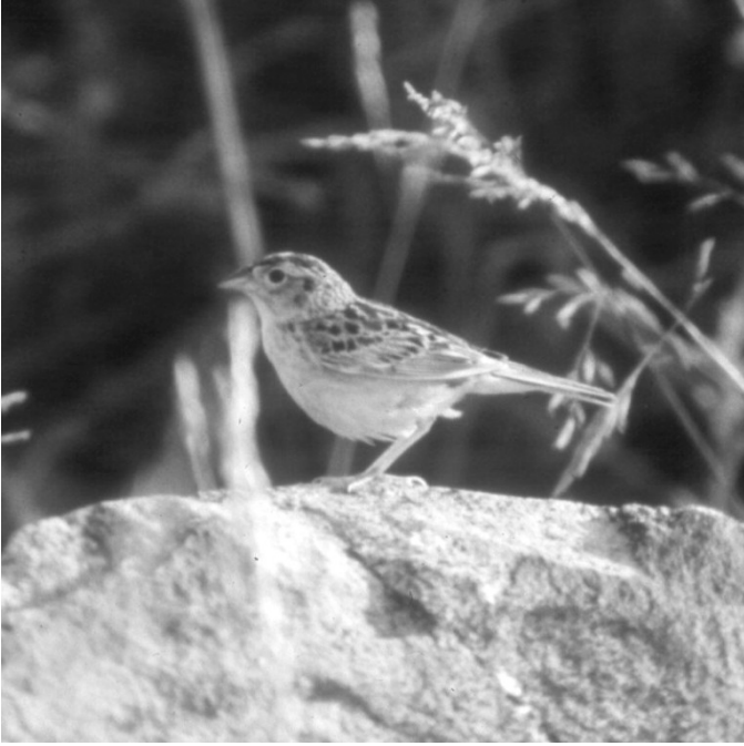
Grasshopper Sparrow ( Ammodramus savannarum ). South Sproul SF, Clinton, 21 June 2004.