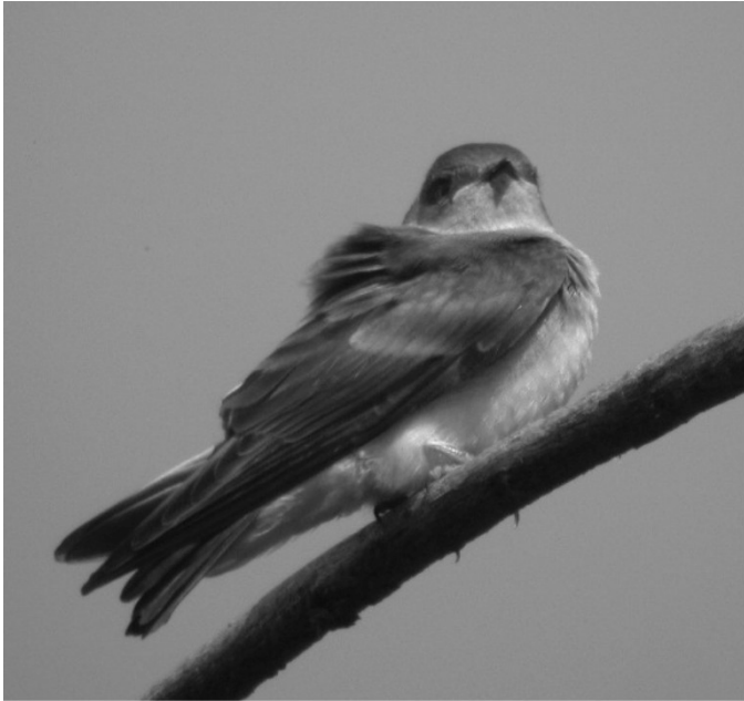
Northern Rough-winged Swallow ( Stelgidopteryx serripennis ). 24 July 2004, Imperial, Allegheny (Geoff Malosh).