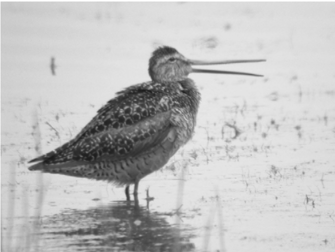
Long-billed Dowitcher ( Limnodromus scolopaceus). This early fall adult was photographed 18 July 2004 at Bald Knob, Allegheny. A first county record.