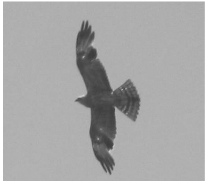
Mississippi Kite ( Ictinia mississippiensis). This was one of two birds present near Lumberville, Bucks 10-27 June 2004. The birds were very fond of the 17yr cicadas which provided a large portion of their diet. This bird was photographed 20 June