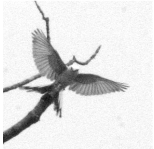
Scissor-tailed Flycatcher ( Tyrannus forficatus ). Nice underneath view again showing short tail and extensive white underparts with lack of deep salmon colored flanks and underwing. Bellgrove, Lebanon 9 June 2004. (Tom Johnson).

Scissor-tailed Flycatcher breeds in south-central portion of the U.S. They wander regularly throughout the rest of the lower forty-eight and Canada. There approximately 16 records of this species for Pennsylvania with the majority falling in the period of mid-May-August. This is the third June occurrence. The