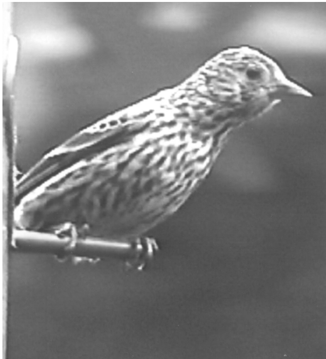
Pine Siskin ( Carduelis pinus ). Unusual in summer, this bird was photographed 1 July 2004 Saylorsburg, Monroe