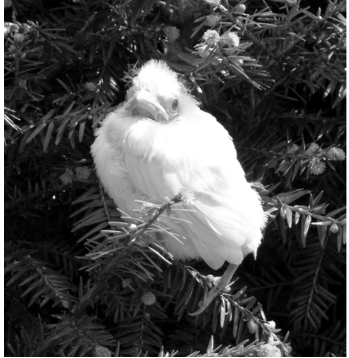
Northern Cardinal ( Cardinalis cardinalis). This albino hatchling was photographed in Montgomery, June 2004.