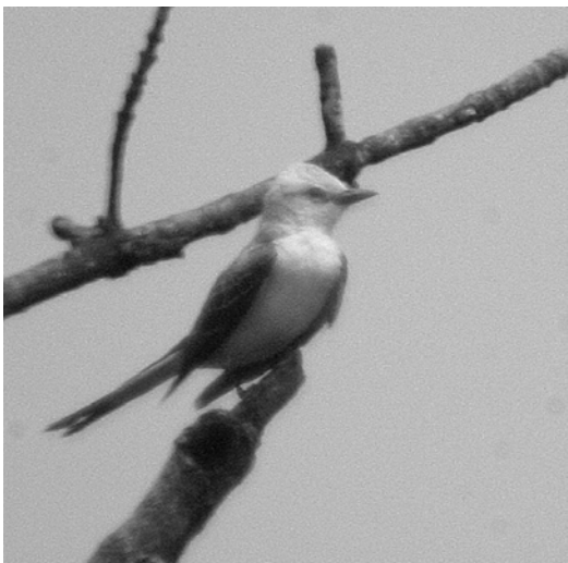
Scissor-tailed Flycatcher ( Tyrannus forficatus ). Apparent 1 st year bird showing extensive white below and shorter tail than an adult. Bellgrove, Lebanon, 9 June 2004. (Tom Johnson).

Since 1988 I have participated in the same section of the Lebanon Christmas Bird Count. With the breeding bird atlas the boundaries are somewhat different. Thus on Wednesday June 9, 2004 I found myself on the north side of the Swatara Creek in "new" territory. I had just finished walking a riparian area along the creek and drove away to the east on Black's Bridge road. This area is open meadows.