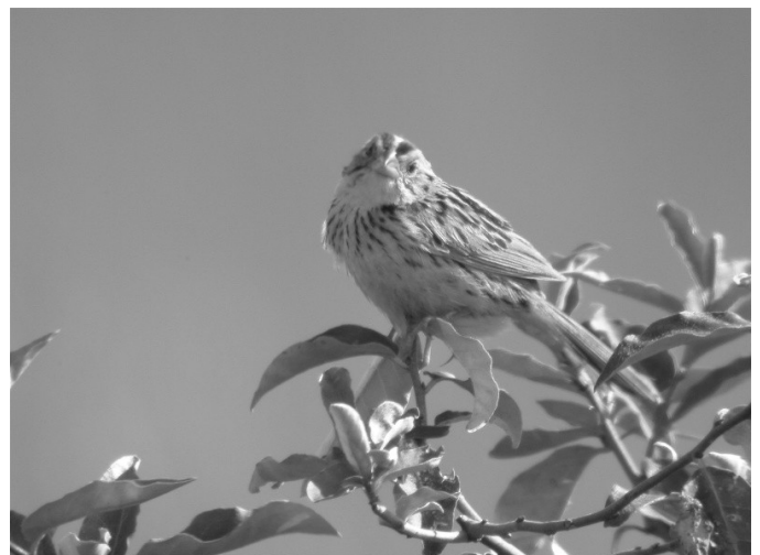
Henslow's Sparrow ( Ammodramus henslowii). 24 July 2004, Imperial, Allegheny.