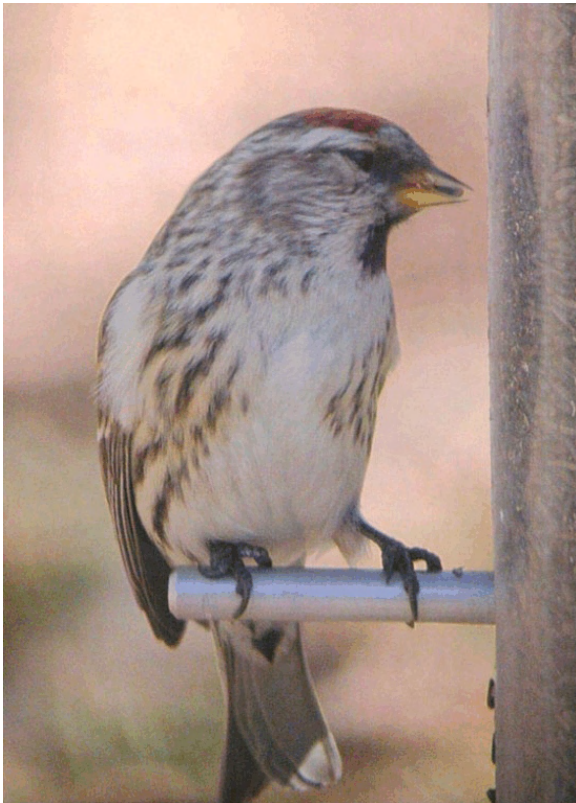
Common Redpoll ( Carduelis flammea). 18 February 2004, Chalfont, Bucks. This was one of eleven present at this feeder beginning 26 January.