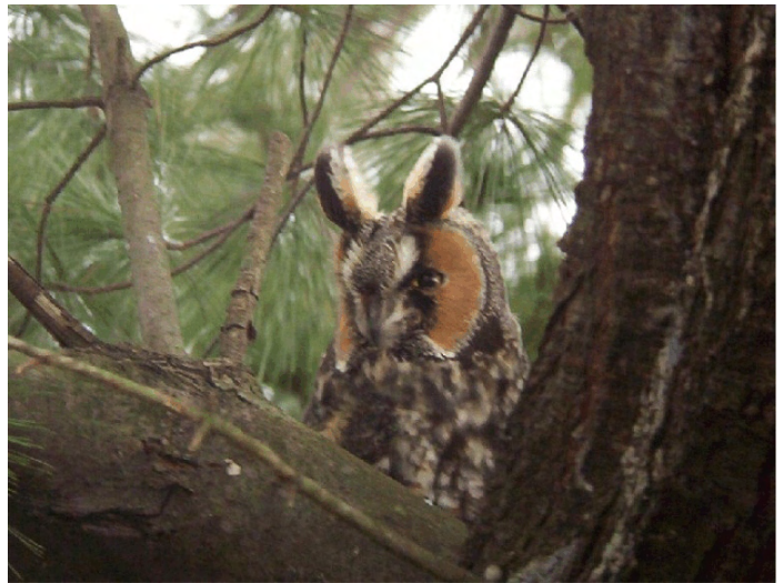
Long-eared Owl ( Asio otus ) Rushland, Bucks, 12 December 2003 (Avery English-Elliot)