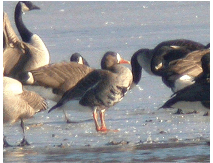
Greater White-fronted Goose ( Anser albifrons ). 28 February 2004, Peace Valley Park, Bucks (Elaine Ryan). One of an increasing number found this winter.