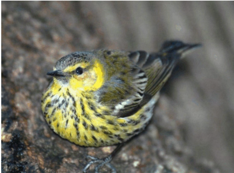
Cape May Warbler ( Dendroica tigrina). This bird was present at Silver Lake Nature Center, Bucks 21 February 2004 through the end of the period. Photographed here 28 February.