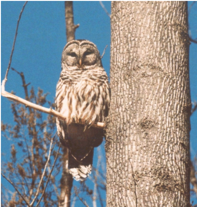
Barred Owl ( Strix varia). 1 February 2004, Martin's Creek, Northampton.