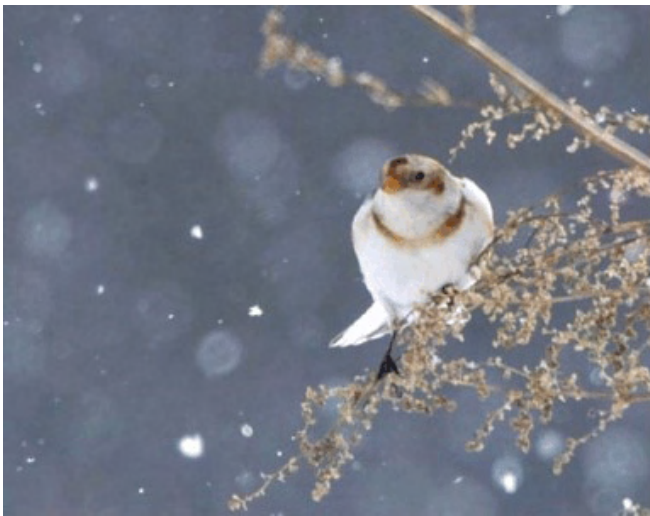
Snow Bunting ( Plectrophenax nivalis ). 20 December 2003, Cogan House, Lycoming.