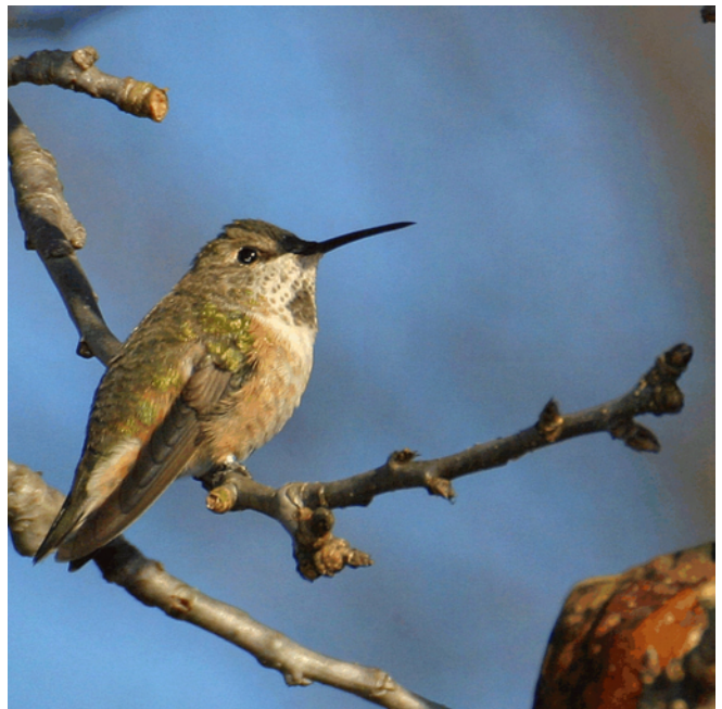
Rufous Hummingbird ( Selasphorus rufus ). This adult female was present in Middletown, Dauphin from late fall and was banded on 16 December 2003. The bird remained in the area into January and was photographed here 1 January 2004.