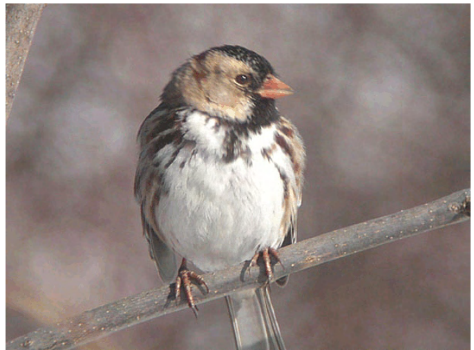
Harris's Sparrow ( Zonotrichia querula). Discovered on 31 January 2004, at Stone Church, Northampton, this adult attracted a large crowd of birders and was still present at the end of the period. Photographed here 10 February.