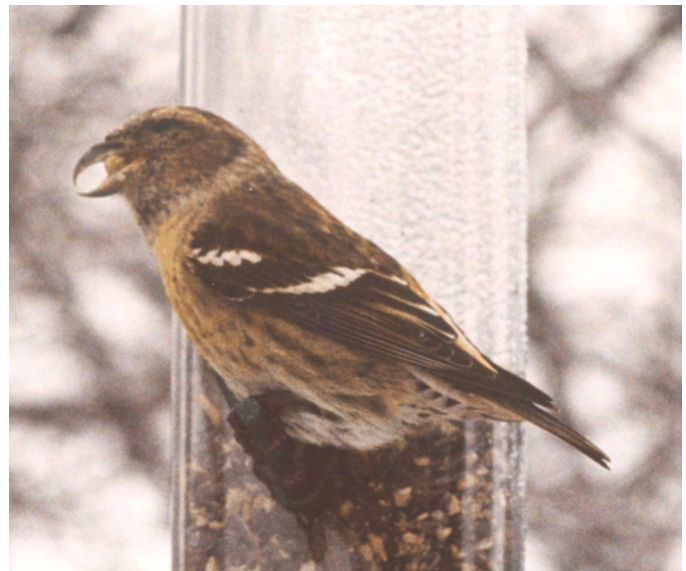
White-winged Crossbill ( Loxia leucoptera ). 18 January 2004. This bird was present most of the winter at a feeder in Saylorsburg, Monroe ( Rick Wiltraut ).