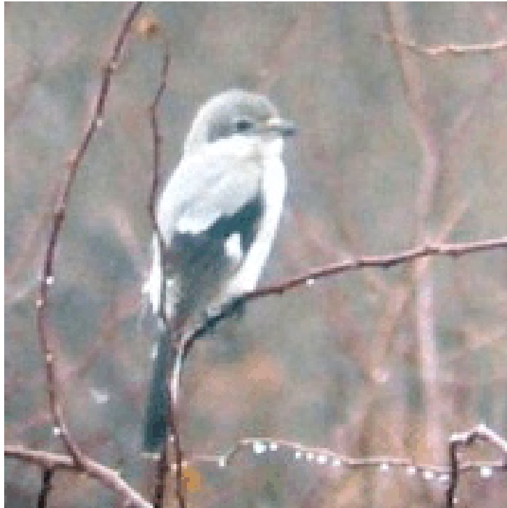
Northern Shrike ( Lanius excubitor ). Bald Eagle S.P., Centre 4 January 2004 (Bob Fowles).