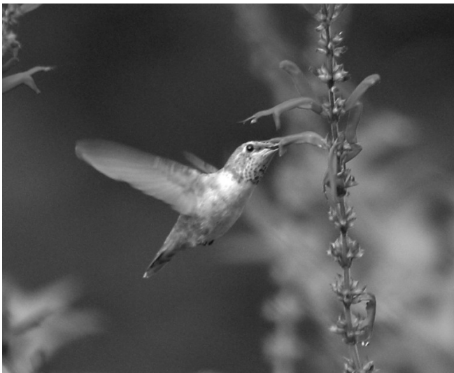
Rufous Hummingbird ( Selasphorus rufus ) This bird was present since 25 October 2003 to about 10 January 2004 in Hilltown Twp., Bucks, when it was found dead. Photographed here December 2003.