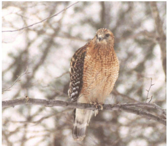
Red-shouldered Hawk ( Buteo lineatus ). February 2004, near Analomink, Monroe (Pedro Baena). This was one of three birds that wintered in this area.