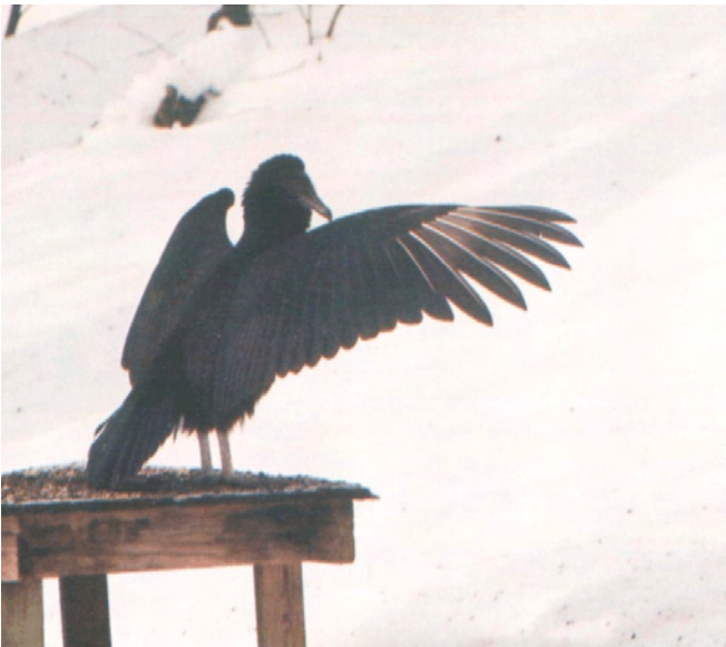
Black Vulture ( Coragyps atratus ). This bird is a great addition to one's feeder list. 2 February 2004, Warrensville, Lycoming (Ed Reish).