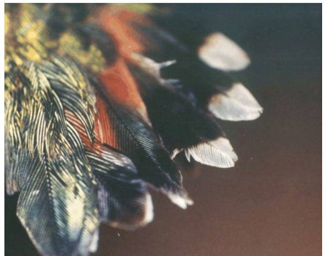
Rufous Hummingbird ( Selasphorus rufus ) Another photo of the Hilltown Twp., Bucks bird. This post-mortem photograph, taken 17 January 2004 (Nick Pulcinella), shows the Rufous Hummingbird tail pattern. The outermost tail feather, r5, shows a wide white tip and r2, the fourth feather from the left, shows a nice notch. Allen's Hummingbird would show a very narrow white tip to r5 and a round or notchless r2.