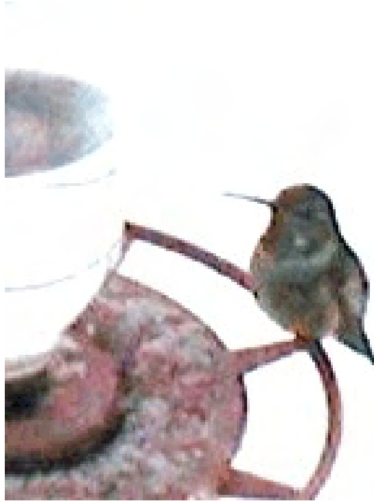
Rufous Hummingbird ( Selasphorus rufus ). This bird present since mid-October 2003 in New Freedom, York remained until 23 January 2004. Photographed here during a snowstorm, 6 December (Rich Hurley).