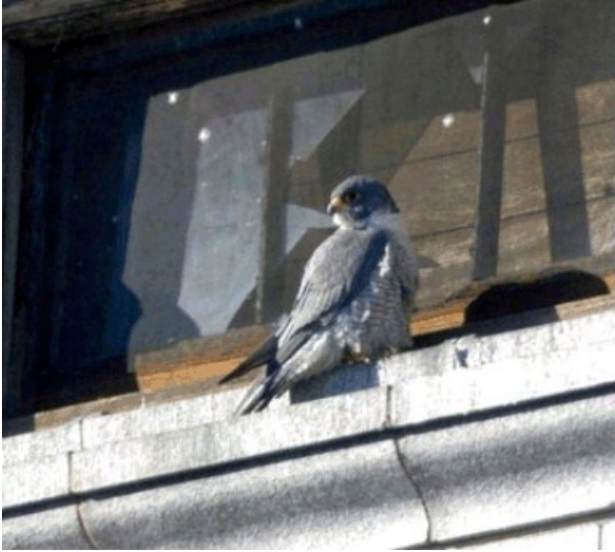
Peregrine Falcon ( Falco peregrinus ). 10 January 2004 (Dave Shollenberger) on a ledge of the Genetti Hotel Williamsport, Lycoming.