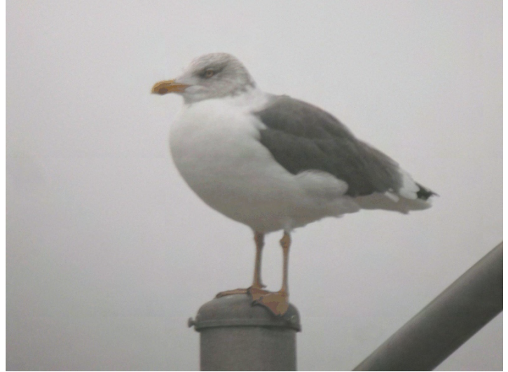
Lesser Black-backed Gull ( Larus fuscus ) While expected in the eastern third of the state in winter, sometimes in triple-digit numbers, this species continues to be rare in western PA. This adult was photographed at Dashields Dam on the Ohio River, Allegheny, 6 December 2003.