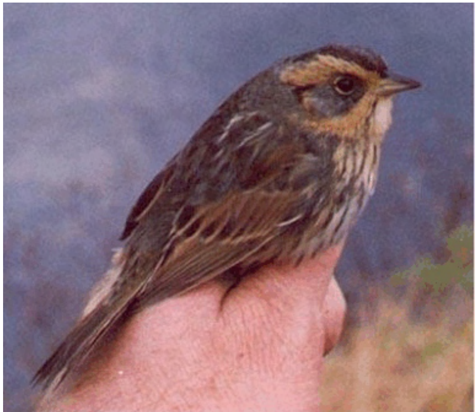
Plate 1. Saltmarsh Sharp-tailed Sparrow ( Ammodramus caudactus ). 12 November 1996 Lake Minsi, Northampton (Rick Wiltraut). This angle shows the dark, sharply defined flank streaking.

A drawing or rough sketch can also be helpful when a camera isn't available; and a drawing isn't dependent upon lighting for accuracy like photos. No matter how poor an artist you are, you should still be able to portray the important field marks that you detected. Obviously, another 'plus' is that you can use the same pencil and paper for the sketch