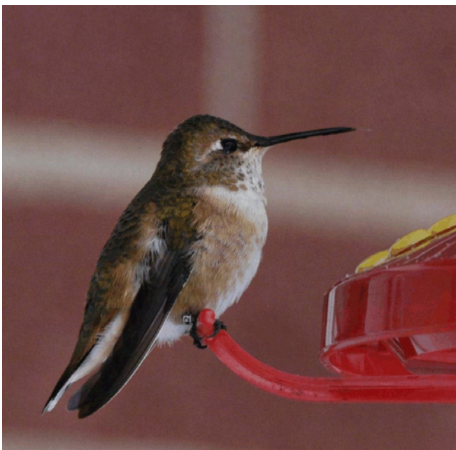
Rufous Hummingbird ( Selasphorus rufus ). 6 December 2003 ( Dave Shollenberger ). This bird was present near Williamsport until 14 January 2004.