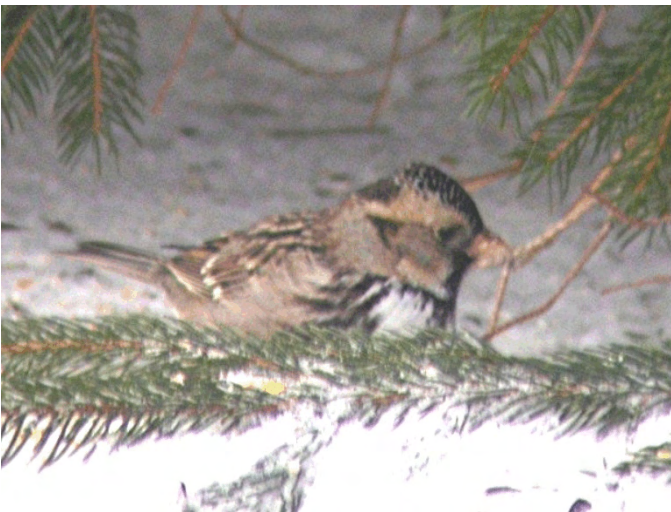
Harris's Sparrow ( Zonotrichia querula ). This obliging bird was present in Sugar Grove, Warren, 7 December 2003 to the end of the period. Photographed here 25 January 2004 ( Geoff Malosh ).