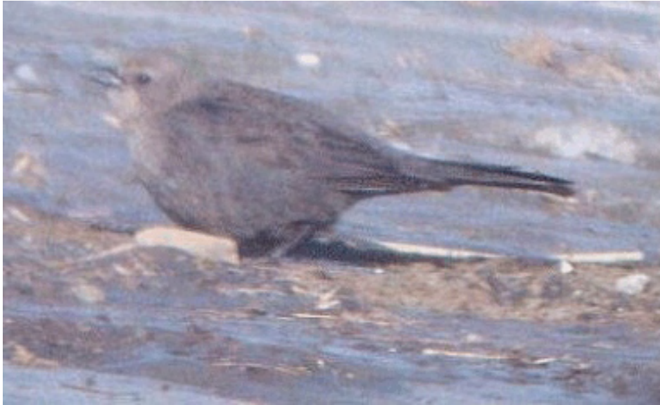
Brewer's Blackbird ( Euphagus cyanocephalus ). 11 January 2004 ( Mark McConaughy ). This female was part of group of two females and a male at Crabtree, Westmoreland 10-11 January for a first county record.