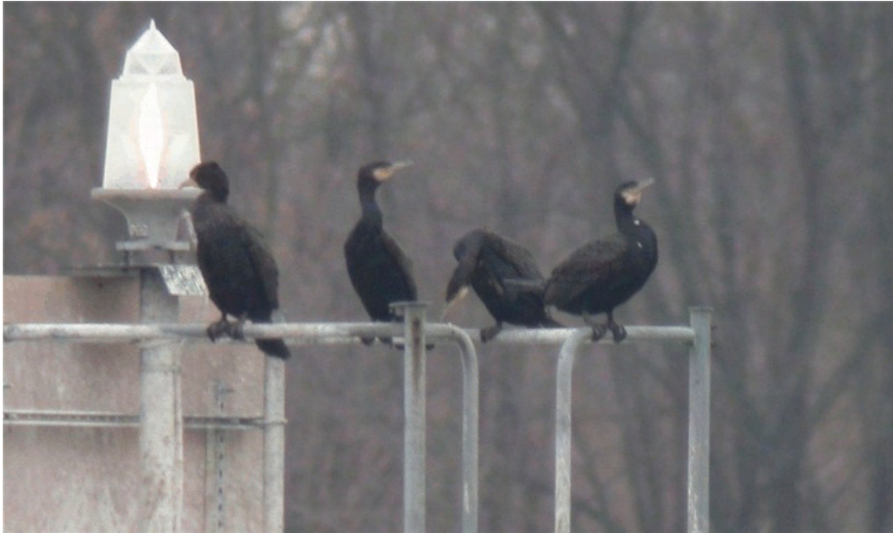
Great Cormorant ( Phalacrocorax carbo ). The lower Delaware River near Bristol, Bucks is probably the best area in the state for finding this species in winter. These four birds were photographed there 17 January 2004.