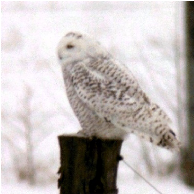
Snowy Owl ( Bubo scandiacus ). This bird was first discovered near the Willow Hill exit of the PA Turnpike, Franklin , 5 January 2004. The bird remained in the general vicinity and was seen by many through the end of the period. Photographed here 24 January.