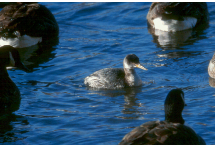
Red-necked Grebe ( Podiceps grisegena). 31 January 2004 along the Schuylkill River near the Betzwood Bridge area of Valley Forge N.P., Montgomery.