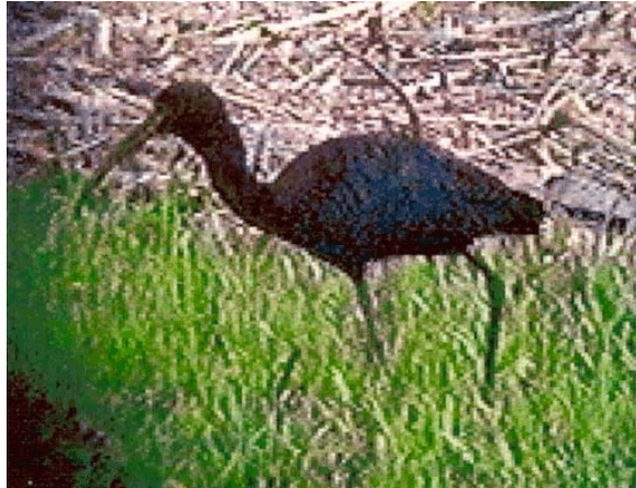
Glossy Ibis, Tullytown, Bucks , 5/17/02