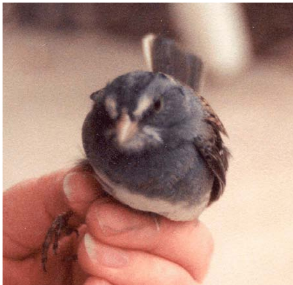
White-throated Sparrow x Dark-eyed Junco hybrid, Lanssdale, Montgomery , 4/8/02