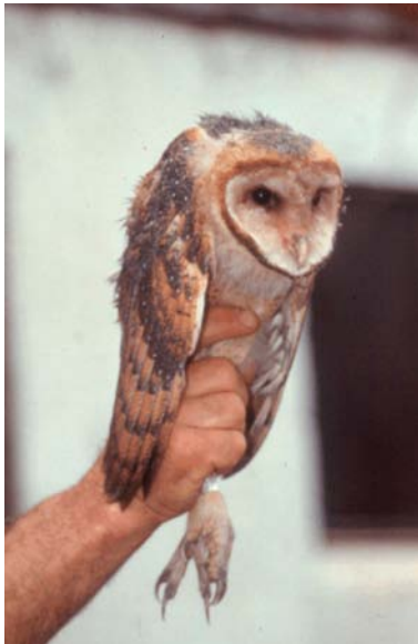
Barn Owl, Van Wert, Juniata, 6/14/02