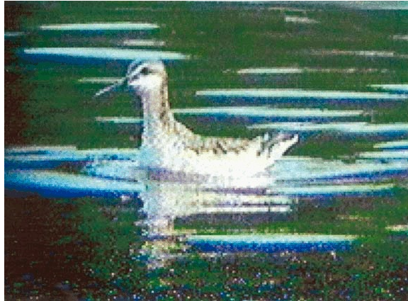
Wilson's Phalarope, Tullytown, Bucks , 5/11/02