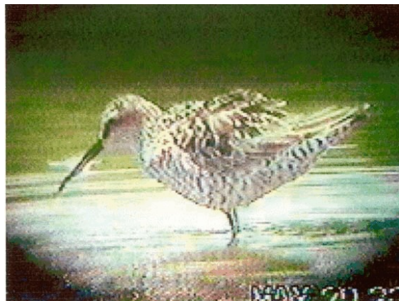
Stilt Sandpiper, Tullytown, Bucks , 5/20//02