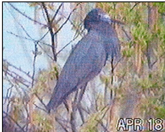
Little Blue Heron, Tullytown, Bucks , 4/18/02