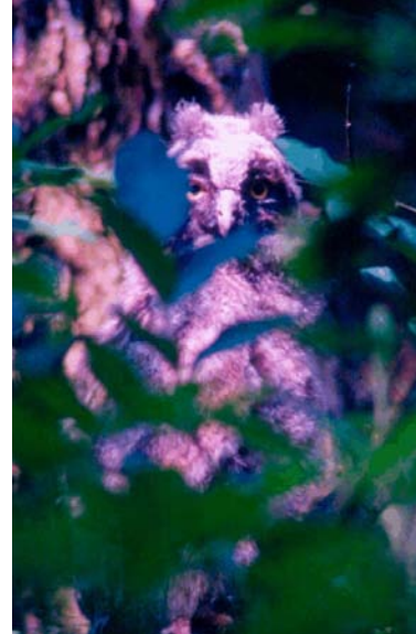
Long-eared Owl,, Montour , 6/9/02