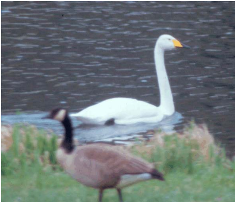
Whooper Swan, Galeton, Potter , 4/21/02