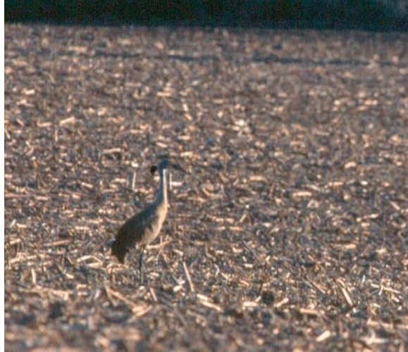
Sandhill Crane, Shessequin Flats, Bradford , 5/28//02