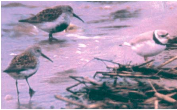
Piping Plover (with Dunlin), Yellow Creek State Park, Indiana , 4/30//02