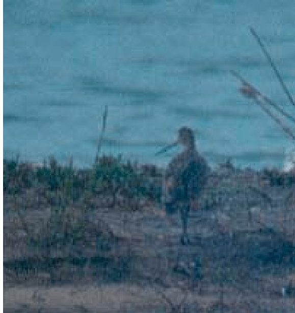
Marbled Godwit, Presque Isle State Park, Erie, 4/28//02