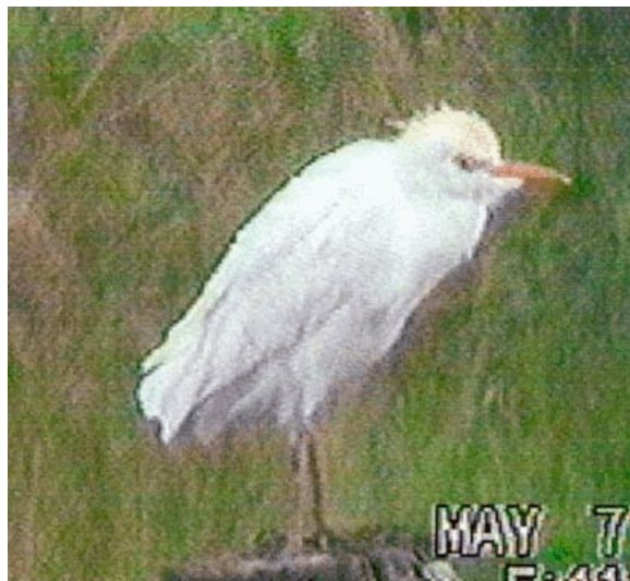
Cattle Egret, Buckingham, Bucks , 5/7/02