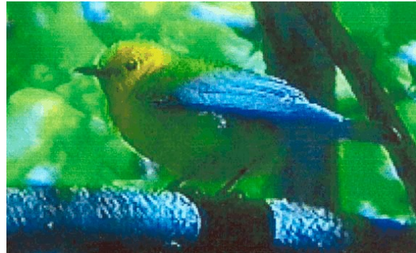
Protonotary Warbler, Tullytown, Bucks