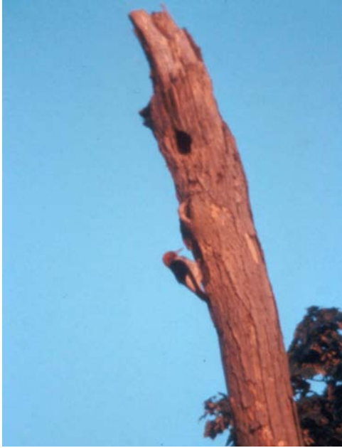
Red-headed Woodpecker, California, Montour , 6/17/02