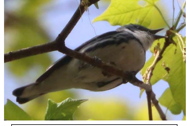
Cerulean Warbler in a Right-of-way, Ricketts Glen State Park. A new population.

PGC Wildlife Recovery team and its partners at Erie and Presque Isle have done an excellent job of protecting these species and promoting their successful reproduction against many challenges. The first step is to recognize that these species belong in Pennsylvania and that they deserve to have priority for the intense management that they need. It also focuses on other species for