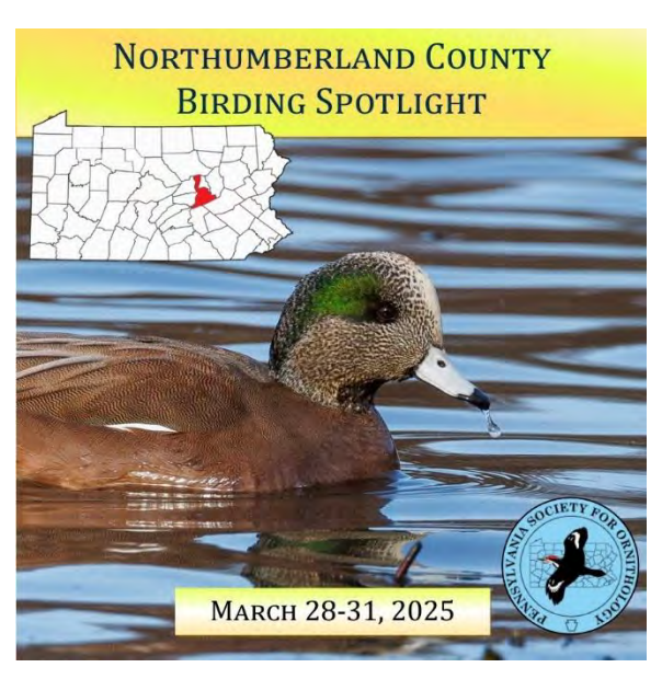
Mark your calendars!