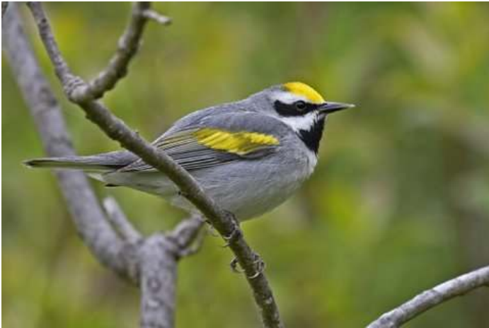
The Golden-winged Warbler is in a steady decline, especially in the Northeast.