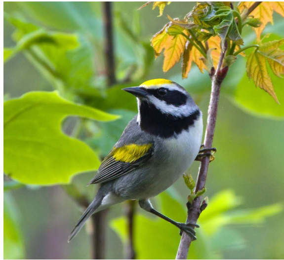
A great site for Golden-winged Warbler is the Woodcock Management Area of State Game Lands 107.