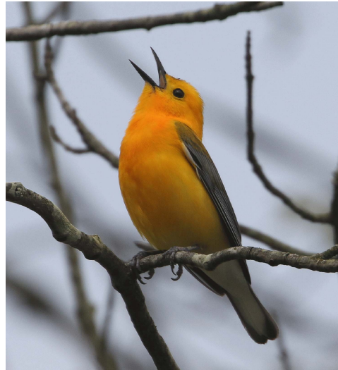
We had some awesome point blank views of Prothonotary Warbler.