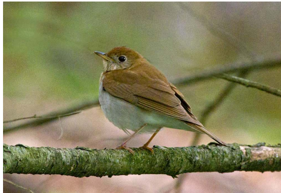
This is just one of the ten Veeries we spotted along Lingle Valley Road.

Warblers and 3 Blackburnian Warblers . After our next stop at the very similar STONE CREEK ROAD where we added nothing new to our list, we then went to TREASTER VALLEY ROAD where we surprisingly spotted one very late Pine Siskin for our day's list along with 2 Northern Parulas .