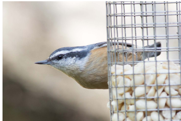
Will Red-breasted Nuthatches be found in unusual locations after the influx last winter?

If you are a beginning birder, don't feel intimidated about attending – experienced birders are always glad to assist you. The meeting will feature field trips, speakers, and awards presentations as usual. The silent auction will be suspended this year for several reasons, but alternative funding methods for the Youth Scholarship are being developed. We will have a memorial sale of items from a long-time member as one funding activity.