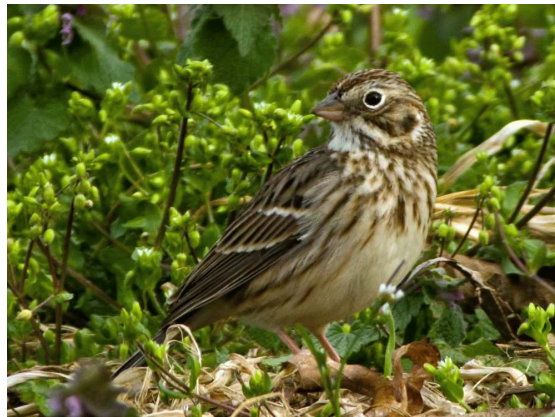
Vesper Sparrow can be found along Back Mountain Road.

We left the state forest and continued into the Big Valley traveling along a meandering stream on BACK MOUNTAIN ROAD. This certainly different habitat provided additional species. The 31 species we listed in this riparian habitat included Warbling Vireo , Vesper Sparrow , Field Sparrow , Eastern Meadowlark , and Baltimore Oriole . Rob shared with me that a Barn Owl is currently nesting on a farm along Back Mountain Road and that the area is good for Rough-legged Hawks in winter.