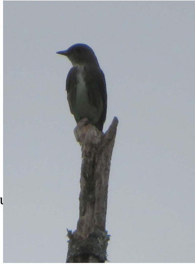
This Olive-sided Flycatcher was photographed along the Five Bridges Trail, Jefferson Co., on 9/14/2016.

Recently, Olive-sided Flycatchers have been found nesting in the mountains of West Virginia. Might they also find a home in Pennsylvania's remote forests and bogs? I am looking, and I invite others to join in the search.