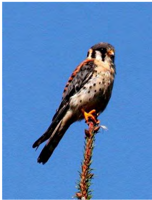
This year's meeting pin depicts the American Kestrel.

The neglected crate is filled with leftover brochures and holds the big three-ring binder that I used to organize and manage my Regional Coordinator responsibilities – contact information for block owners, block maps, field and summary effort cards. But the atlas work of 2004-2009 has been largely forgotten. The crumpled “Official Survey Vehicle” sign in the map holder in our Expedition provides one of the scattered reminders, as did a return to a long forgotten Region 73 Atlas block as we just recently carved a new Winter Raptor Survey route along the back