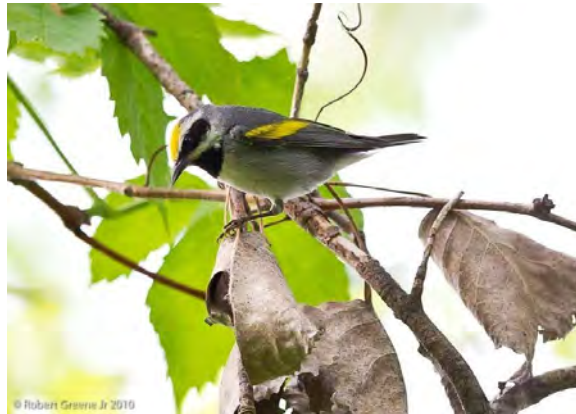
The Golden-winged Warbler has experienced a catastrophic decline in recent decades.