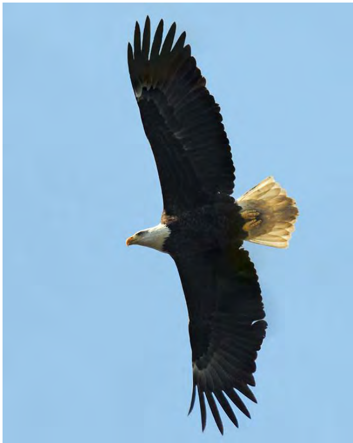
The Bald Eagle nesting season is already well underway.

Eagle nesting season is well underway. Most pairs are already incubating. In the 2011 nesting season, we monitored 217 active nesting pairs in 50 counties that produced at least 209 fledglings. As early as November, we were finding new nests, often with the help of the interested public. It is a growing challenge to monitor each Bald Eagle nest. We often know about an active nest but don't hear whether it produced young or failed. We also need good estimates of how many young are produced at each nest. Fledglings can be confirmed by seeing individuals moving outside the nest, even in the nest tree. If a nest fails, we would really like to learn why. In most cases, bad weather is to blame, but human